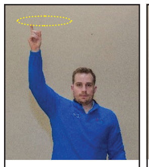
ACTIVATE EAP circle overhead with index finger