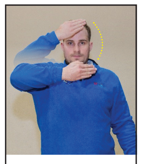
UNCONSCIOUS ATHLETE hand up and down over face