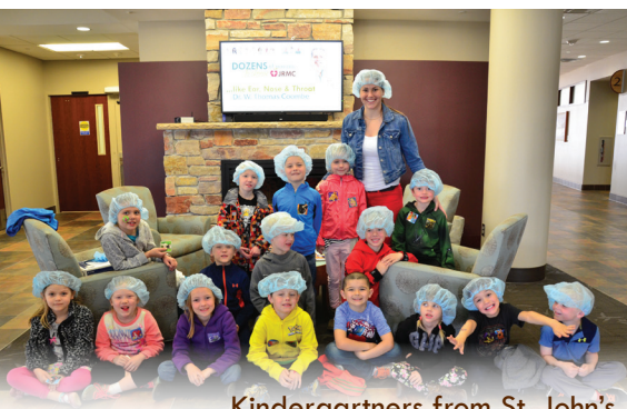
Kindergartners from St. John's Academy tour JRMC.