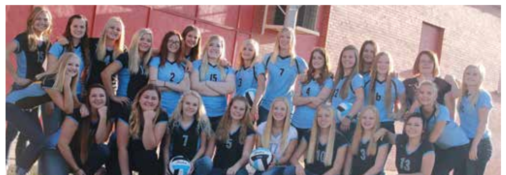
Team Photo by

The event included selling onesies, baked goods, photo booth, cash raffle and coin drop. Families who were open about the loss of their infants shared photos of their babies. For more information about the ANGELS fund visit www.jrmcnd.com , click on Foundation.